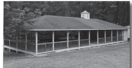
The 'Twins Tabernacle was built in 1996, named after Trustee Al Smart.

About The 'Twins Ministry: 6th – 8th Graders meet each morning at 9:30 am – 12:15 pm at the 'Twins Tabernacle. 'Twins are encouraged to hang out from 3 pm—5 pm in the afternoon and after the Evening Service. Attendance varies between 80—100. The 'Twins Team consists of more than 20 dedicated volunteers and staff of all ages.