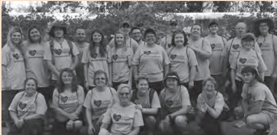
The Lizzie Project is a USA based ministry that shares Christ’s love through scholarships, backpacks and evangelism to students in Choluteca, Honduras, and outlying villages. TheLizzieProject.org