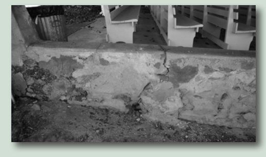
Water damage is eroding floors and foundations.